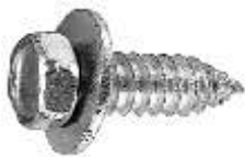
Hexagon Head Sems® Tapping Screws (Washer Loose From Head)